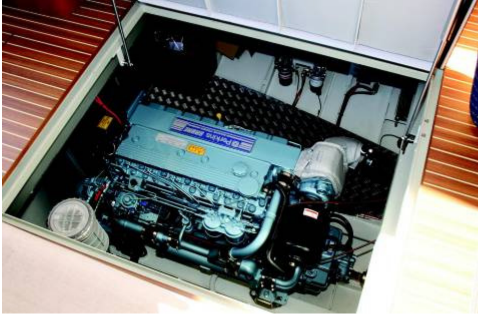
left: "Well executed and easily accessible electrics"