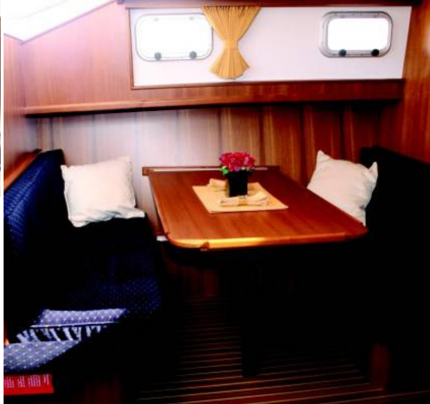
top left: "The deck saloon is comfortable, with a fine view of the outside world" Bottom left: "Everything to hand and ample stowage in the well finished galley" Right: "The dedicated dining area is to port, opposite the galley"

options are available – twin bunks running along the hull side or a big double bed on the centreline. Lockers and cupboards (under the bed and on the hull side) provide plenty of stowage, and – as elsewhere in the boat – the abundant teak joinery makes for a relaxing atmosphere. There's no way this Pedro 44 could ever be confused with a GRP production line boat – even when you are lying in bed.