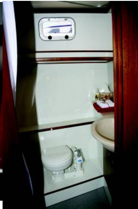
left: "Master cabin aft - a room with a view" right: "The second heads is forward"